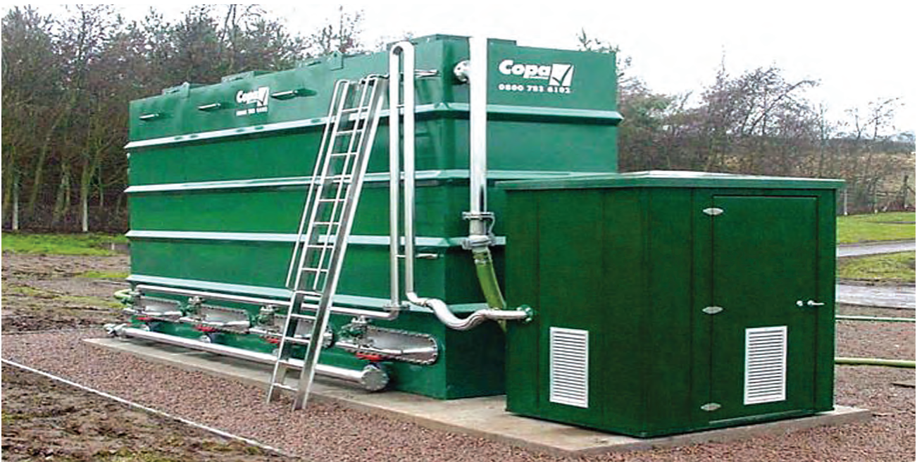
The design of the SAF is compact and efficient—less than 1/4 the size of suspended-growth aeration tanks of comparable flow and BOD capacity.