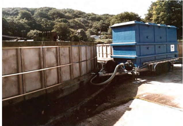
SAF units can be trailer-mounted for mobility, making them ideal for emergency, supplemental, or temporary use, or for pilot studies.