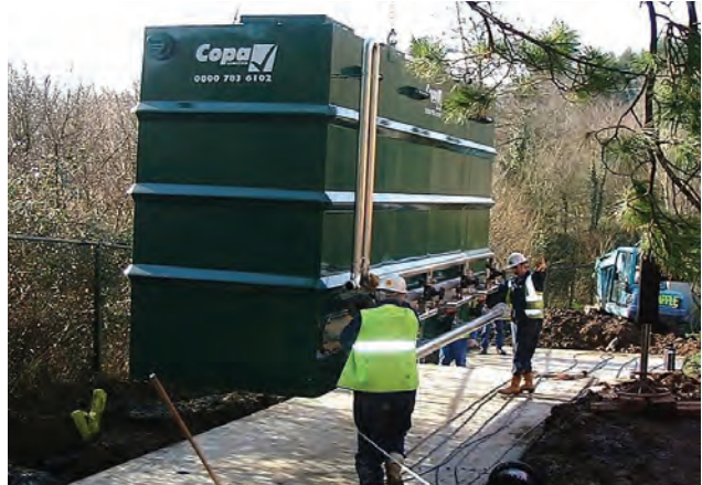
Pre-assembled units are easily transported and rapidly installed.

PWTech will arrange transport to site, installation, and periodic inspection of the units to ensure satisfactory operation. Rental units include the SAF, the clarifier, and an enclosed kiosk housing the blowers and controls.