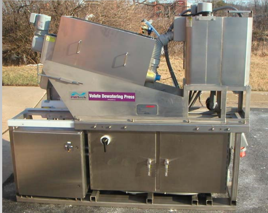
New ES131 Pilot Unit

PWT had finished it's second Volute Dewatering Press pilot unit (see photo at right). This ES 131 is a slightly newer design than our existing KD202 Pilot unit. It is also quite a bit smaller which lends itself to indoor applications. While our goal is ultimately to put this unit in an enclosed trailer, in the interim, we are transporting it in a storage crate meaning it is well protected and should arrive at sites completely undamaged which is sometimes an issue with the current pilot.